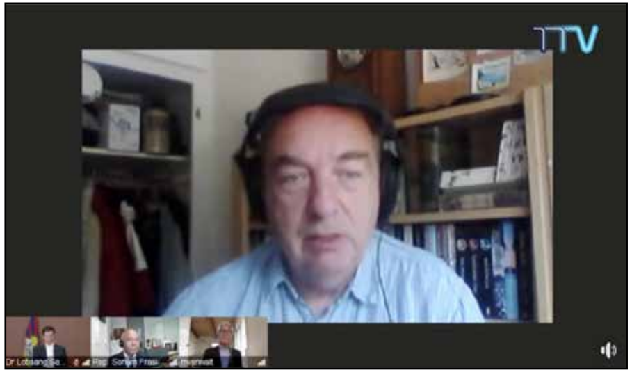
UK should mirror US' Reciprocal Access to Tibet, impose sanctions on Chinese officials meddling in the Dalai Lama's succession: Former UK Minister and MP, Rt Hon Norman Baker.

"First, we need to mirror the US with the Magnitsky Act to impose sanctions on individual members of the Chinese