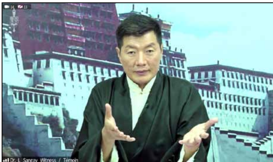
CTA President Dr Lobsang Sangay speaking at the first formal hearing on China of the Canadian House of Commons Special Committee on Canada-China Relations.