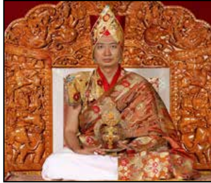
Sakya Trizin Rinpoche greets on His Holiness' 85th Birthday

"The legacy of His Holiness the Great 14th Dalai Lama is unfathomable, so much so that the greatness of His Holiness' legacy far surpasses that of the combined lineage of previous Dalai Lamas," His Eminence said.