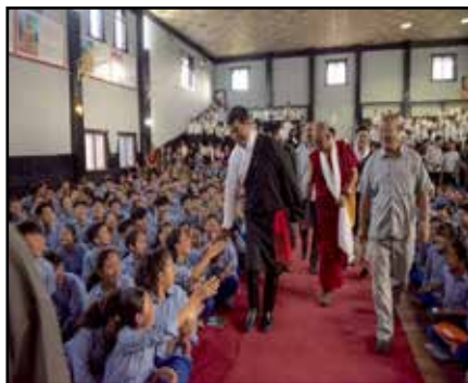
Sikyong Dr. Lobsang Sangay during a visit to TCV Selakui.

For the first time since the inception of the prestigious Sikyong Scholarship in 2013, the number of students to receive the award has soared to 19—setting an all-time record for the most number of Tibetan students to score 95 percent and above ever in history.