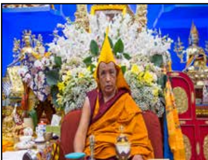
Kyabje Gaden Tripa greets His Holiness the Dalai Lama on 85th birthday

Paying glowing tributes to His Holiness the Dalai Lama on the occasion of his 85th birthday, His Eminence the 104th Gaden Tripa urged all Tibetans to take a pledge on the day to implement His Holiness the Dalai Lama's teachings and make His constant messages of oneness and compassion the guiding principles of their lives.