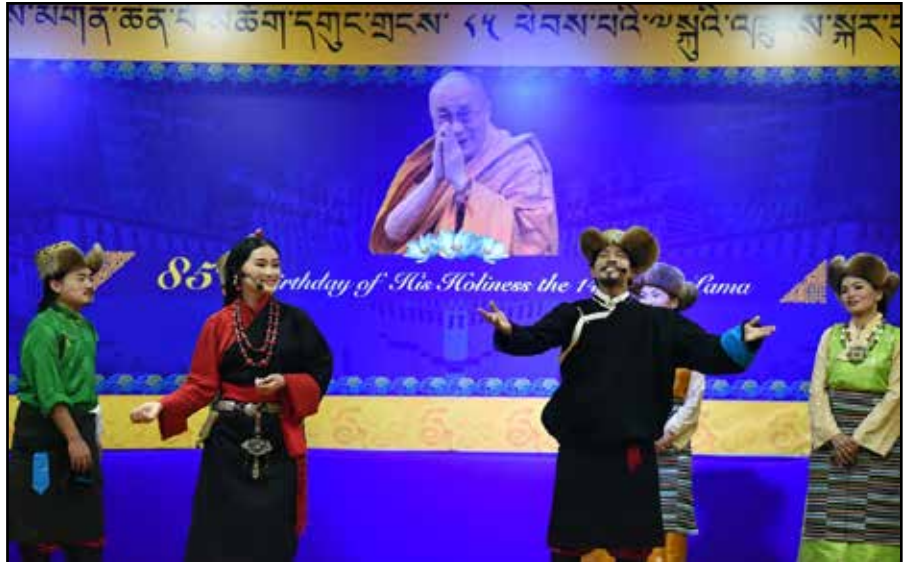
Artists of TIPA presents an ode to His Holiness the Dalai Lama at the official celebration of His Holiness the Dalai Lama's 85th birthday.