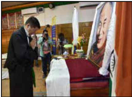
Sikyong Dr Lobsang Sangay offers obeisance before a portrait of His Holiness the Dalai Lama at the official celebration.

dedicated as “Year of Gratitude” to His Holiness the Dalai Lama.