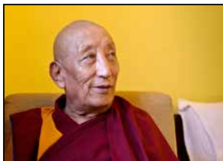
A picture of Geshe Jampa Gyatso in life.

Geshe Jampa Gyatso, a Tibetan Buddhist scholar and former political prisoner has entered rare spiritual meditative state of thukdam after being declared clinically dead on 14 July, according to Office of Tibet, Taiwan. Geshe Gyatso was a spiritual guide at OOT, Taiwan.