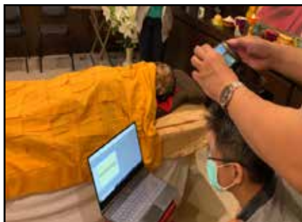
Neural activity is examined by scientists.