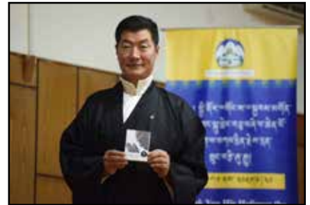
Sikyong unveils a booklet of 113 popular quotes of His Holiness the Dalai Lama, an initiative of the Department of Information and International Relations as part of the CTAs’ yearlong gratitude campaign.

Though the official ceremony ends here, public celebrations of His Holiness’ birthday continues across the world and most importantly, the CTA led “Year