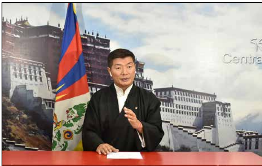
CTA President calls the US sanctions on top Chinese officials ‘a right and a timely message to China’ File image

Among those sanctioned was the architect of the grid-style surveillance and detention camps, Chen Quanguo. Chen developed the grid system of mass physical and technological surveillance when he was party secretary of the Tibet Autonomous Region from 2011 to 2016. He later replicated the same tactics over an amplified scale in the Uyghurs