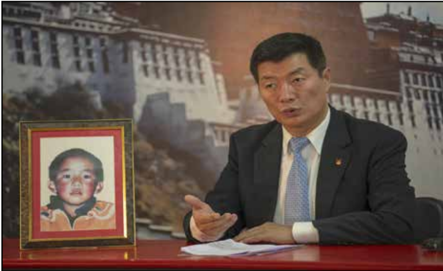
CTA President Calls on China to Heed the Demands of the UN Experts to Provide Information and Access to 11th Panchen Lama

Five UN independent mandate holders: the Working Group on Enforced or Involuntary Disappearances; the Working Group on Arbitrary Detention; the Special Rapporteur in the field of cultural rights; the Special Rapporteur on minority issues; and the Special Rapporteur on freedom of religion or belief issued a joint communication on 25 years long enforced disappearance of Tibet's 11th Panchen Lama Gedhun Choekyi Nyima by the government of China. In this regard, the President of the Central Tibetan Administration Dr. Lobsang Sangay issued the following statement: