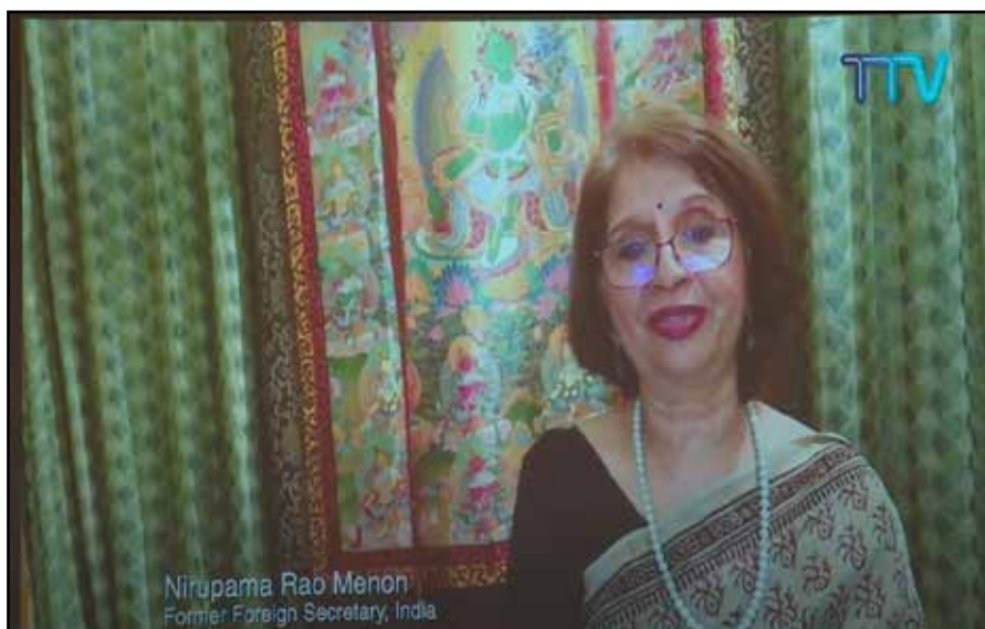
Former Indian Foreign Secretary greets His Holiness the Dalai Lama on 85th birthday. Screenshot image

At a time when the world is being swept by the forces of hypernationalism, the fracturing of democracies, the rise of authoritarianism, the tyranny of the majority, the anthropological threat of a global pandemic, His Holiness has upheld our faith in justice, kindness, tolerance, equality and the fellowship of all humanity, overcoming the high barriers and walls of divisiveness and the rivalries of power politics. From my early childhood, I have learnt much from the teachings of His Holiness, and I have been privileged to have met and interacted with him. He is undoubtedly, one of the greatest, most charismatic, most inspirational and most historic figures of our time. His spontaneous