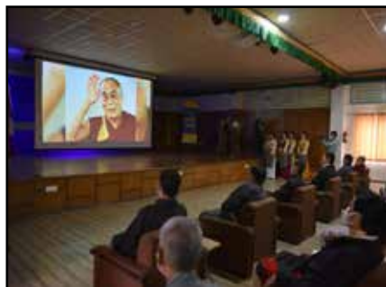
The gathering of high-level CTA dignitaries watching a compilation of video messages from leaders, Nobel laureates and friends of His Holiness the Dalai Lama from all over the world.