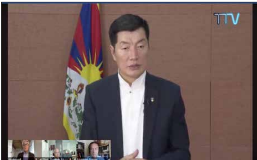
CTA President Sikyong Dr Lobsang Sangay speaks at the virtual panel discussion on "USA calls Free Nations to change Chinese Communist Party: Analysis and Prospects for Tibet" organised by Office of Tibet, London. Screenshot image

Touching on the global anti-China sentiment due to the handling of coronavirus, Sikyong Dr Lobsang Sangay stated that China continues to face major backlash, citing a recent