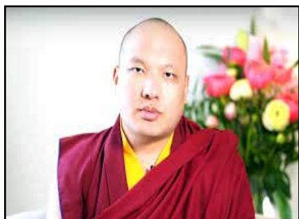
17th Gyalwang Karmapa Ogyen Trinley Dorje greets His Holiness the Dalai Lama on 85th birthday

On the occasion of His Holiness the Dalai Lama's 85th birthday on July 6, wishes poured in from heads and figures of various traditions of Tibetan Buddhism and native Tibetan Bon tradition. A compiled video messages from the heads of Sakya, Gelug, Kagyu, Nyingma, Bon and Jonang tradition of Tibetan Buddhism were screened at the CTA's official celebration this morning.