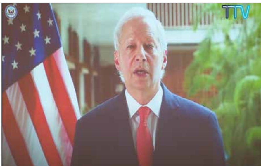
US Ambassador to India, Kenneth Ian Juster greets His Holiness the Dalai Lama on the 85th Birthday. Screenshot image

The presentation to you in 2007 of the Congressional gold medal by your friend President George W. Bush stands as the preeminent demonstration of the high regard in which you are held in the United States of America. In the words of President Bush during the presentation ceremony in the US capital, “You are a universal symbol of peace and tolerance. A shepherd for the faithful and the keeper of the flame for his people. This is why all of us are drawn to a noble and spiritual leader who lives a world away.” I believe the warm feelings between Americans and Tibetans spring in part from the recognition that your's is a just and noble struggle. A struggle to secure for your people the same self-evident and unalienable rights of life, liberty and the pursuit of happiness that our founding fathers enshrined in the “Declaration of Independence”. You may have read these words on the walls of the Jefferson memorial when you visited that landmark in 1991. We like to think that these words may have had some influence on Your