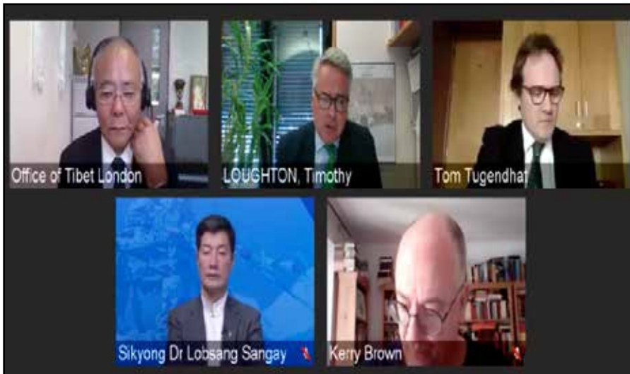
Panelists on Tibet and Hong Kong: a spotlight on broken promises of China.

The relationship between the UK and China has become significantly worse than it was since Xi took over as the President. Xi has made it harder and harder for countries like the UK to deal with. As far as the UK is concerned there are very obvious touchstones most obvious is Hong Kong to whom the UK has a remaining obligation under the Sino-British Joint Declaration recognising and granting residency to almost 3 million eligible Hong Kong citizens. He also highlighted the grave about China's attempt to influence academic freedom in the UK. He expressed alarm over the London Chinese embassy's role in organising different protests and pressurizing Chinese students and their parents in mainland China thereby undermining independence in academic excellence in some of the UK's finest institutions.