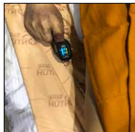
The vital statistics are examined for noticeable differences.