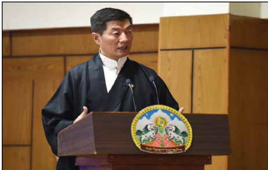
CTA President Dr Lobsang Sangay delivering the statement of the Kashag on the 85th Birthday of His Holiness the Great 14th Dalai Lama of Tibet.

Today we celebrate the 85th birthday of His Holiness the Great Fourteenth Dalai Lama, Jetsun Jampel Ngawang Lobsang Yeshe Tenzin Gyatso. The Kashag and the Tibetan people, those inside Tibet and those in exile pay our heartfelt greetings to His Holiness, the most revered leader of Tibet, the world's leading spokesman for peace, the epitome of Buddha's wisdom and unconditional compassion.