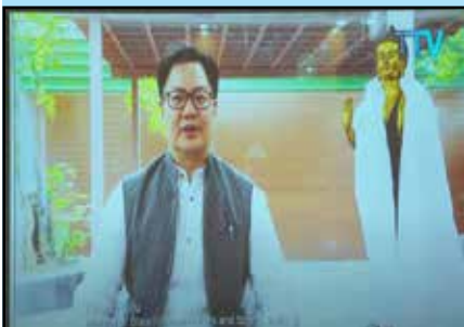
India's State for Youth Affairs and Sports Minister Kiren Rijju greets His Holiness the Dalai Lama on his 85th birthday.

India's minister of the State for Youth Affairs and Sports, Honourable Shri Kiren Rijju greets Tibetan spiritual leader His Holiness the Dalai Lama on his 85th birthday in a video message broadcasted earlier this morning.