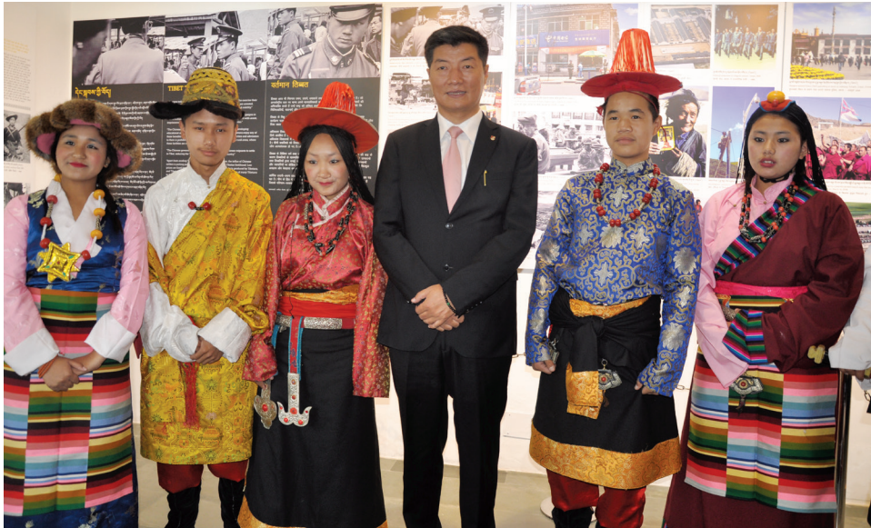
Sikyong Dr Lobsang Sangay with a group of Tibetan school children in traditional Tibetan costumes

Sikyong Dr. Lobsang Sangay lauded the Tibet Museum's relentless hard work in raising awareness on the Tibet issue. He also stated that museums remain one of the most powerful mediums to preserve the rich cultural heritage of Tibet and further political narrative on the Tibetan struggle. He called on Tibetans, particularly those still in schools and colleges, to visit the Tibet Museum to gain a deeper insight into the Tibetan political struggle and life of Tibetans in exile.