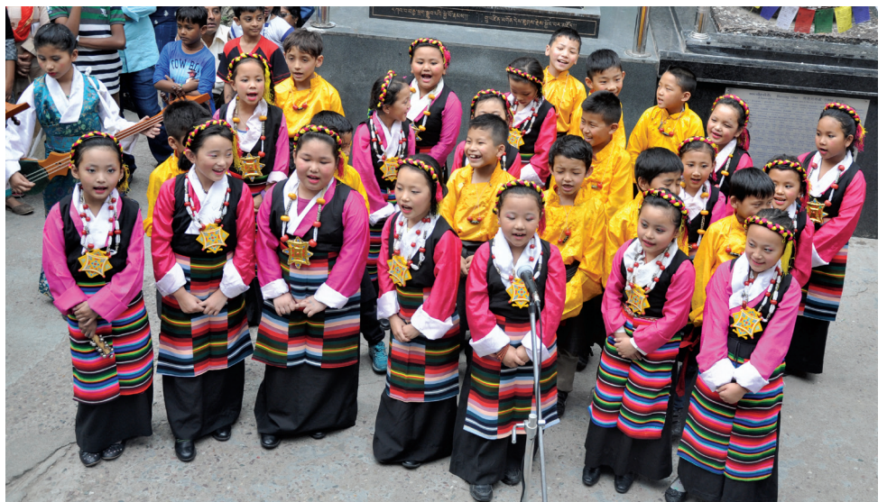
School children from Mewoen Petoen school presenting a Tibetan group song

The festival was a resounding success. More than 4,500 people visited the Tibet Museum during the three-day event, including many first-time visitors.