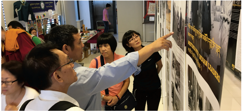
Visitors going through exhibition at Poh Ming Tse Temple, Singapore

Around one thousands participants, including students and entrepreneurs, attended the daylong festival and visited the Tibet Museum's exhibition.