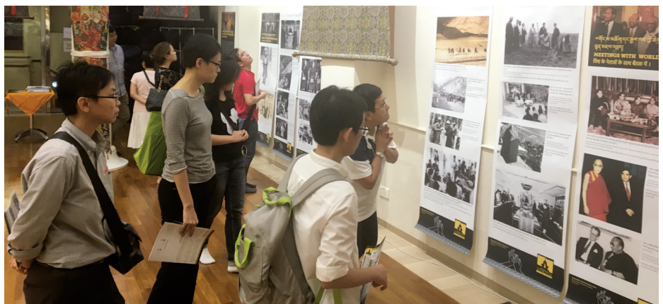
Visitors at the Tibet Museum's exhibition at Amitabha Buddhist Center

Around 1,500 people, mostly Chinese, came to see the eight-day-long photo exhibition on His Holiness's life and messages at the four different venues in Singapore. The visitors commended the efforts of the organizers and the Tibet Museum for holding the exhibition—a first of its kind in Singapore.