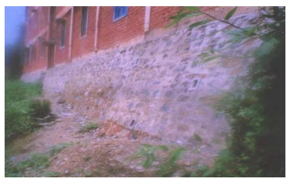
Retaining wall constructed at 'E' Block building, Shimla

Tibetan Welfare Office, Shimla has completed the construction of retaining wall of 'E' Block building and roof renovation of weaver's quarters at Tibetan Handicraft Center, Shimla with kind fund support of Rs. 206,640.00 and 735,579.00 respectively from Polly C. Yau through Tibet Fund, New York.