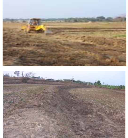
Constructing field contour bunds and trenches at camp 8, Mundgod

Around 49 Young Tibetan Farmers, left for an 11-month Agriculture Training cum experience gaining program at AICAT – Arava, Israel. This is the 9th batch of Tibetan Trainees attending the training program in Israel. The trainees are from different Tibetan Agriculture settlements like Tezu, Miao, Tuting, Tenzingang, Rawangla, Dolanji, Herbertpur and Kollegal