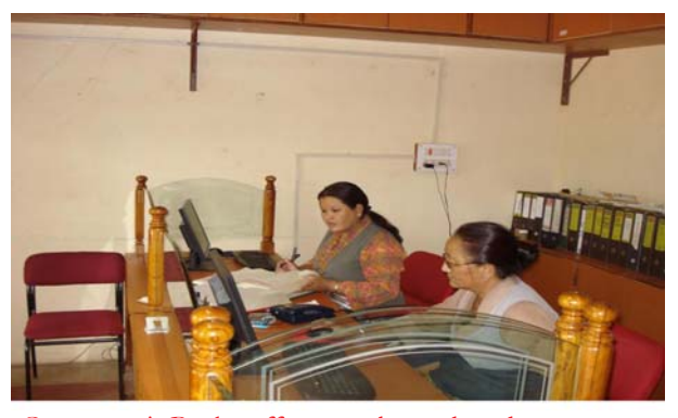
Co-operatvie Bank staffs on newly purchased computers

Under the coordination of Central Tibetan Relief Committee and Federation of Tibetan Cooperatives in India Ltd. a training on computer & budgeting to Accountants and Assistant Accountants of 15 Tibetan Cooperatives in India was successfully organised. The training was implemented from 8<sup>th</sup> - 19<sup>th</sup> October 2007 at Lugsam Tibetan Settlement, Bylakuppe by outsourcing resource person. The total cost of the project was Rs. 553,310.00, and it has been funded by AET, France. The training mainly focussed on basic computer application pertaining to accounts and budgeting. The training helps to upgrade the efficiency of the cooperative personnel in computer.