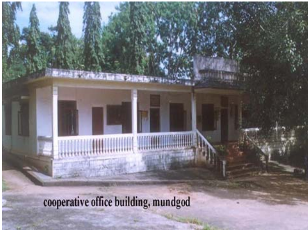
Cooperative Office building, Mundgod