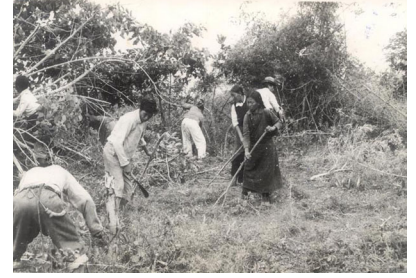
cleaning the bushes & land leveling in 1960

Lugsung Samdupling Tibetan Settlement is the first Tibetan settlement established in India. It was started in 1960 with the help of Indian Government and Swiss Technical Cooperation for the initial population of 3000 settlers. This settlement is also one of the largest Tibetan refugee settlements in India and the total area of the settlement is 3210 acre.