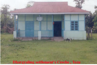
Renovated Crèche building, Tezu

Institutional building such as Primary Dispensary, Crèche, Old People's Home, Office building, community hall and Kinder garden were renovated at Dhargyeling Tibetan Settlement, Tezu with the overall budget of Rs. 286,000 duly funded by Tibetan Cultural Society of British Columbia, Canada.