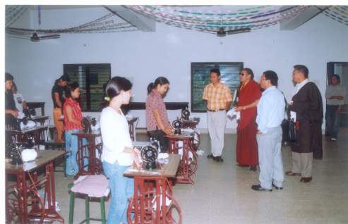
Visitors at our tailoring training class