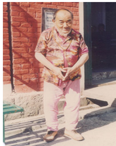
on 28/2/2006 at OPH, Dharamsala.