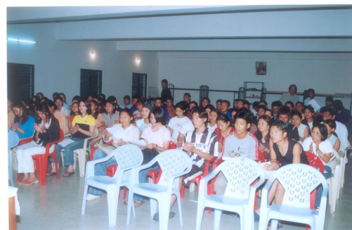
Trainees during the conference