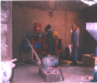
Oil Compressor, Bhutan