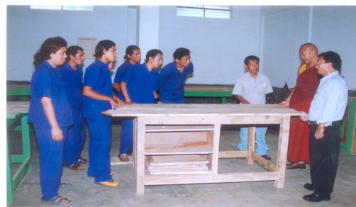
Our trainees taking advice from Visitors